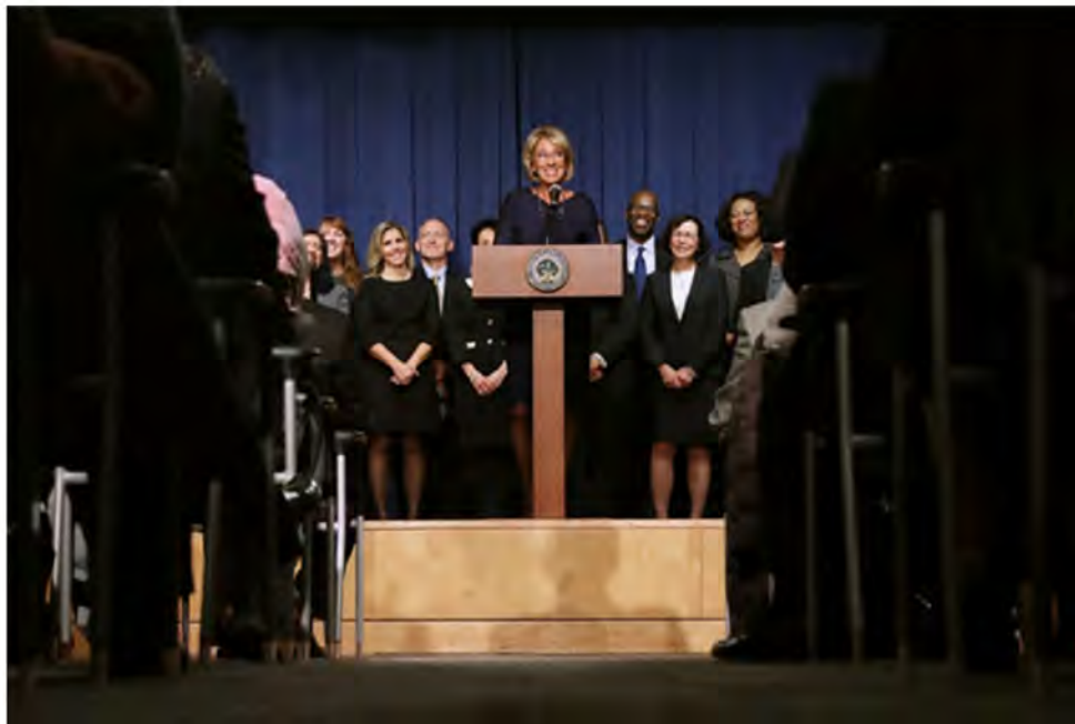
Education Secretary Betsy DeVos on Feb. 8, her first day on the job at the Department of Education