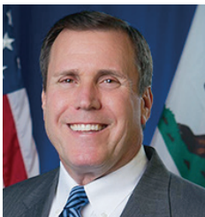
SENATOR SCOTT WILK